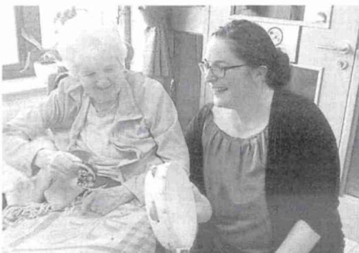
■ Care South's St Martins Grange care home in Gillingham, recently enjoyed a fun session from Musica, a music-led workshop to help stimulate the mind and encourage movement